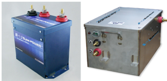
Figure 3. Heavy-duty supercapacitors feature two positive terminals, one for the engine starter and one for the battery. This prevents the battery from the constant wear and tear from typical engine start discharges.

The Smart Start approach offers the flexibility to start an engine either off the battery or the supercap, or a combination of both. Because the starter receives a charge from the supercapacitor, it can operate at lower temperatures. Supercapacitors operate down to -40°F. The Smart Start design is optimized for starting and system capability. A controller determines how much energy is pulled from the supercaps and it offers the longest battery life of the three installation schemes. Starting is also protected from house loads.