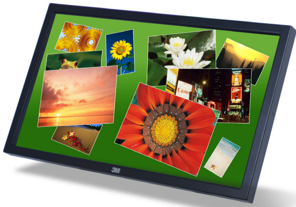
32-inch 3M™ Multi-Touch Display C3266PW

The C3266PW display also features a premium LCD with 1080p Full HD resolution for sharper images, LED backlights for enhanced color brilliance, reduced power consumption, ultra-wide 178 degree viewing angles for consistent views throughout the exhibit, and a 120Hz refresh rate that ensures digital content maintains sharp even when in motion. The premium LCD helped enhance the user's interactive experience by delivering brilliant interactive content and enticing passersby to visit the exhibit.