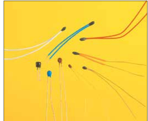
Coated Chip Style