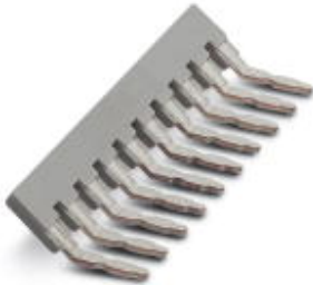
Insertion bridge, Number of positions: 10, Color: gray

Please be informed that the data shown in this PDF Document is generated from our Online Catalog. Please find the complete data in the user's documentation. Our General Terms of Use for Downloads are valid ( http://phoenixcontact.com/download )