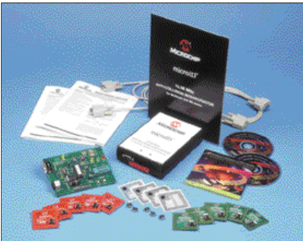
The microID Developer's Kit (DV103005) includes everything needed to start a design.