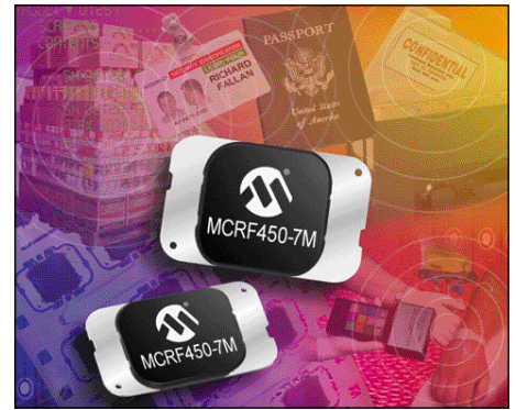
The MCRF450/7M COB Module.

Microchip manufactures more than 500 million serial EEPROMs and microcontrollers per year using its proven and reliable process technology. This experience and leadership brings many complementary strengths to the RFID tag market,