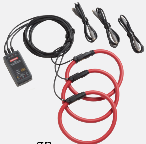
CT-53 Flex Current Sensor

← . . . . High performance processor for accurate, detailed data recordings