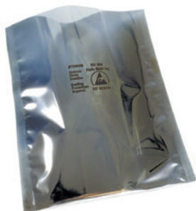
3M™ Metal-Out Static Shielding Bag 1500

These bags are tested to meet or exceed certain electrical and physical requirements of ANSI/ESD S541 and to be ANSI/ESD S20.20 program compliant. Bags are RoHS Compliant* and lead-free**.