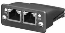
Active - (Industrial Ethernet)