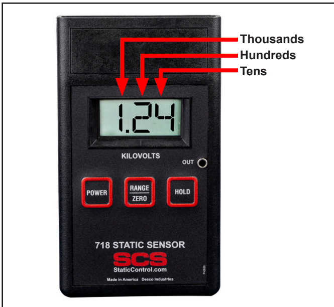
Figure 3. Reading the Static Sensor while in the \pm 20 kV range