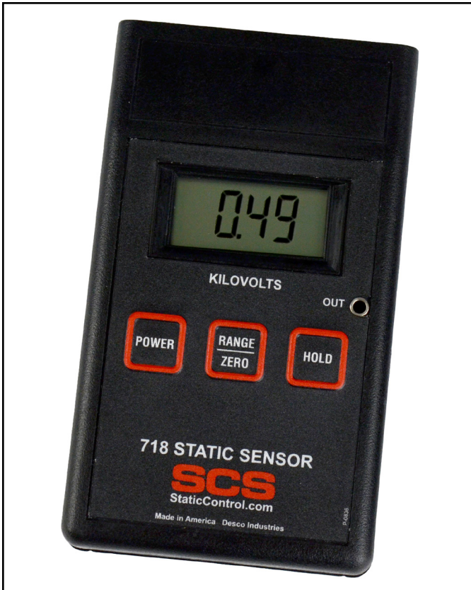
Figure 1. SCS 718 Static Sensor