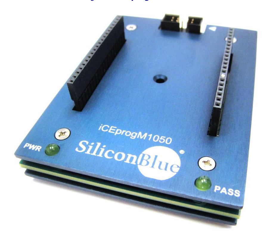
Figure 1: iCEprogM1050-01

To Socket Adapter for iCE65 NVCM programming