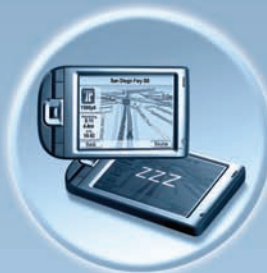
Auto wake/sleep Detection