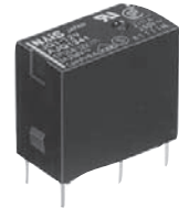
PCB Type Shown